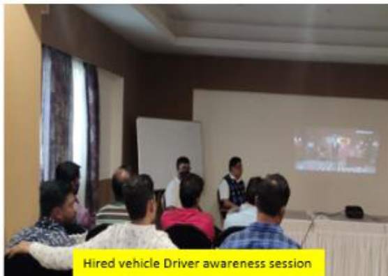
Hired vehicle Driver awareness session