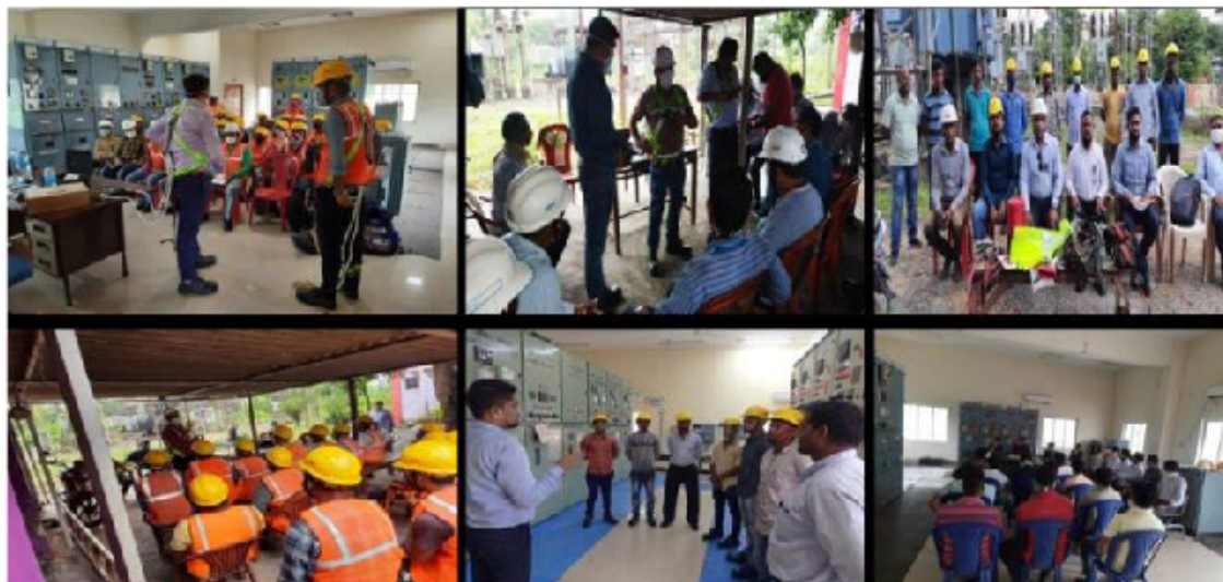
Job Specific On site Training