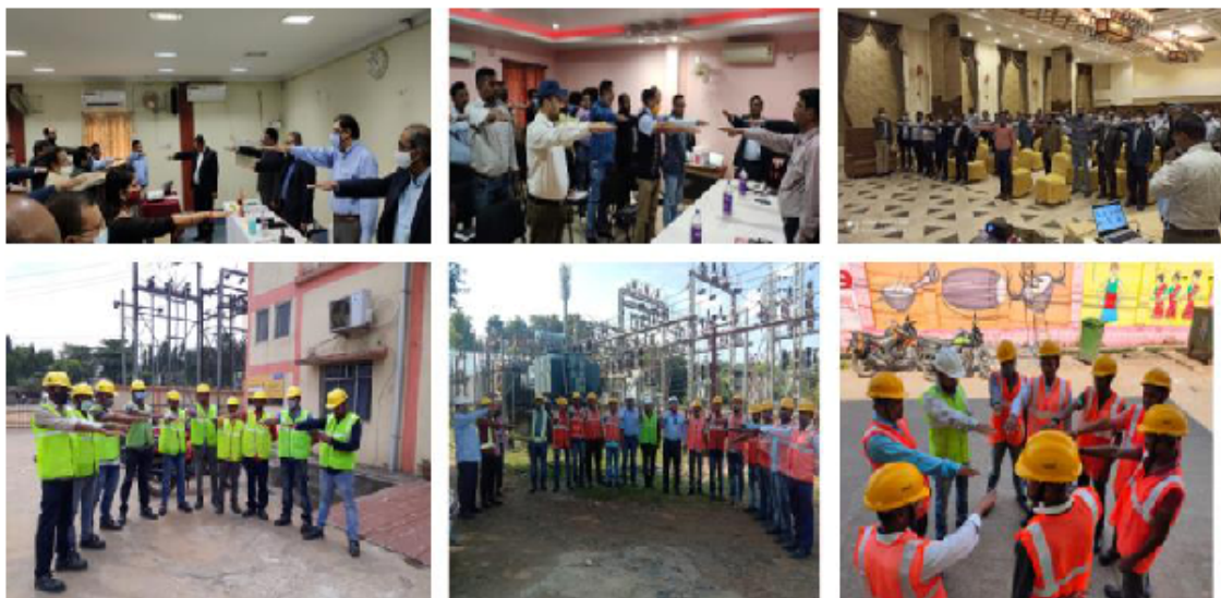
Initiation of Safety Oath