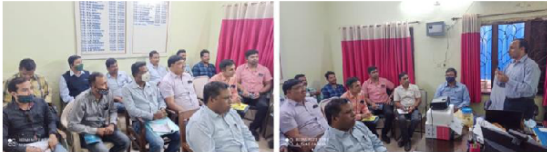
Incident Investigation Awareness session