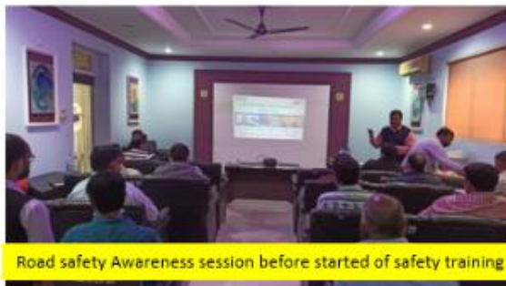
Road safety Awareness session before started of safety training