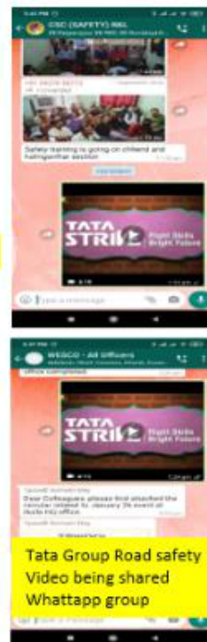
Tata Group Road safety Video being shared Whattapp group