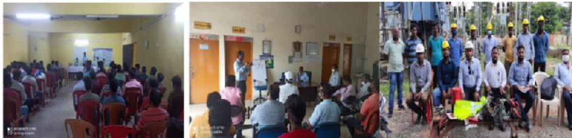
Mass Meeting on Incident communication & Safe Zone creation

Lately the safety journey consisted a wide array of activities and events. Firstly a mass meeting on incident communication was carried out where issues related to communication of incident, guidelines and procedures among other things were covered on one hand while on the other hand the meeting on creation of safety zone brought to light the importance of safety zones, its benefits and need for creation of the same at all sites. Secondly a web-portal for Safety Observation Reporting was launched as well as courses on Safety for employees launched on Gyankosh. Thirdly Safety based training for job specific roles and onsite training was conducted. Fourthly fencing of Distribution Transformers to prevent public and animal accidents. This was followed by HVST by senior leaders of TPWODL. In addition to these safety induction of business associates were carried out through the Safety Marshals, initiation of feedback from safety marshal about availability of safety materials and further requirements for effective use of PPE's at site along with public safety awareness were some recent highlights of TPWODL in the field of Safety.