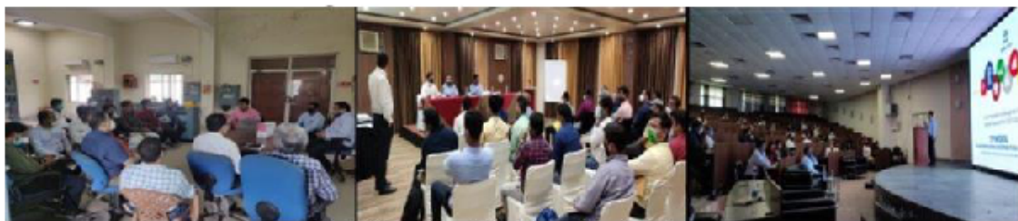
Kick off meeting with Business Associated