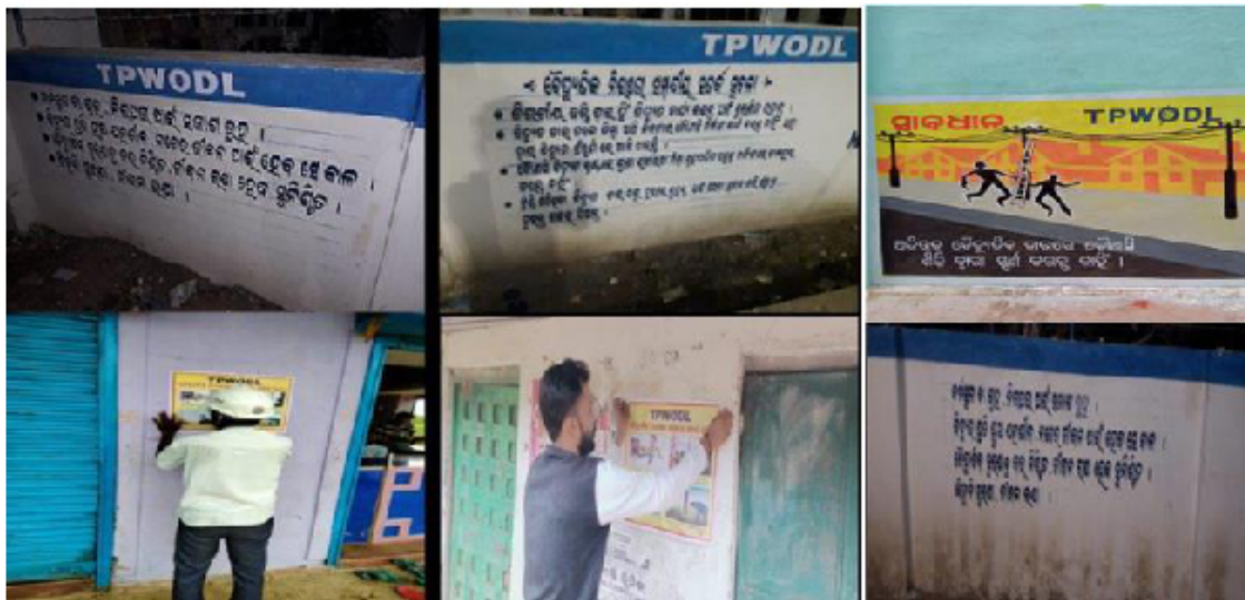
Public safety Awareness Drive