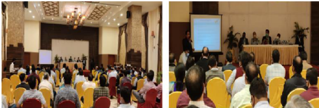
First Kick off safety Meeting with WESCO Management

conduction of road safety awareness sessions were conducted under the larger road safety training programme and publication of office circulars on usage of crushed helmets.