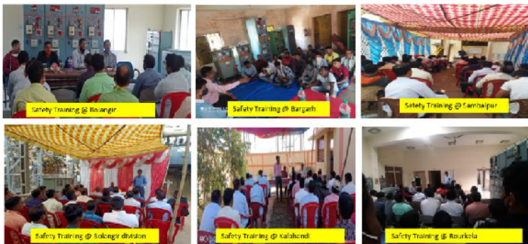
Safety Induction Training