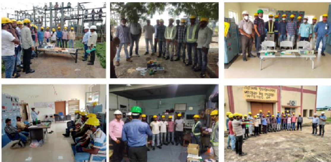
Focus on business associates safety induction through Safety Marshal